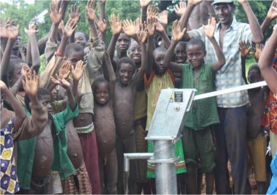
Community members giving their thanks to the Lord for His provision of clean, safe drinking water.