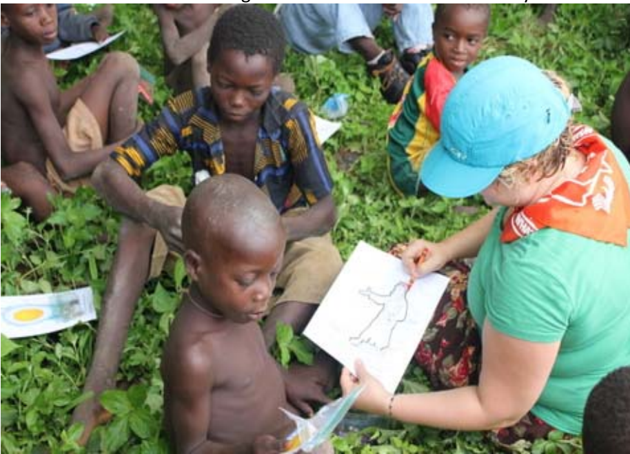
The LWI Burkina Faso team shared hygiene education and oral Bible stories with community members and children who had never seen or been introduced to the idea of crafts. The community children had to be shown how to use the crafts before they could participate in the hygiene education activities.