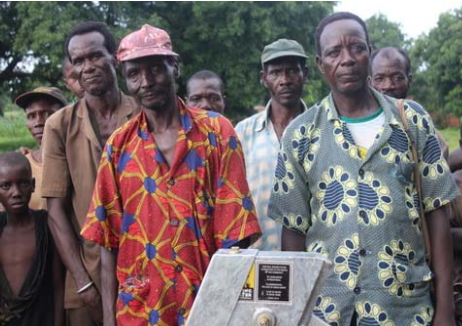
Community water committee established by the community and who are responsible for helping maintain the well and who were provided with a LWI Burkina Faso contact number in case their well were to fall into disrepair, become subject to vandalism or theft.