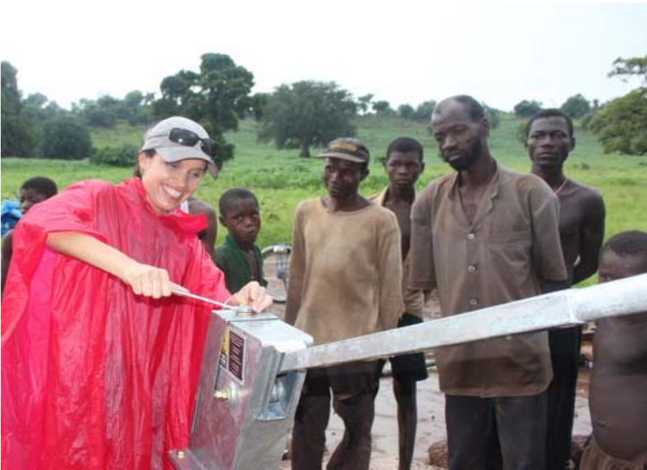
Project in process.