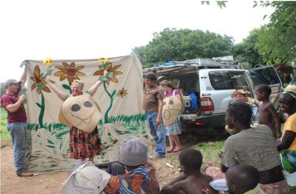
LWI Burkina Faso team sharing oral Bible stories with community families.