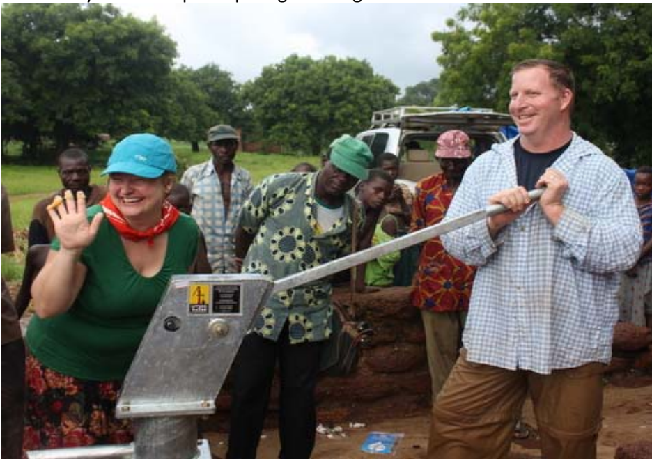
LWI Burkina Faso team members and community members gathered at the well site, at the completion of the project.