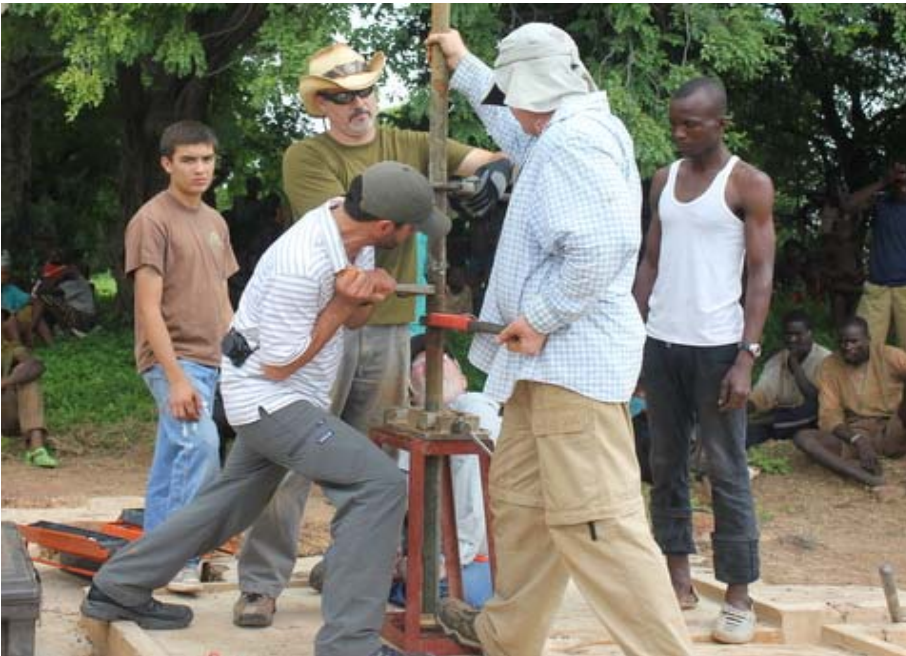
Project in process and community members gathered to observe and assist the LWI Burkina Faso team.