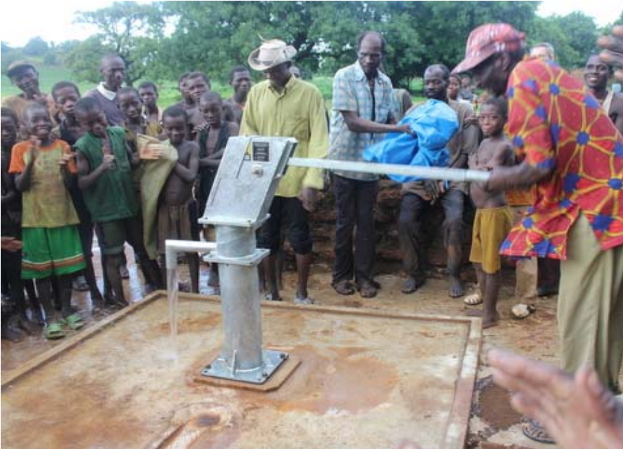
Community members pumping clean, safe drinking water from their new and easily accessible water source.