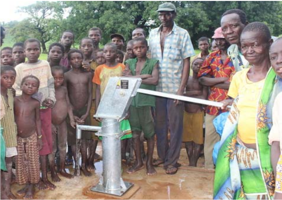
Completed water project and plaque on pump.