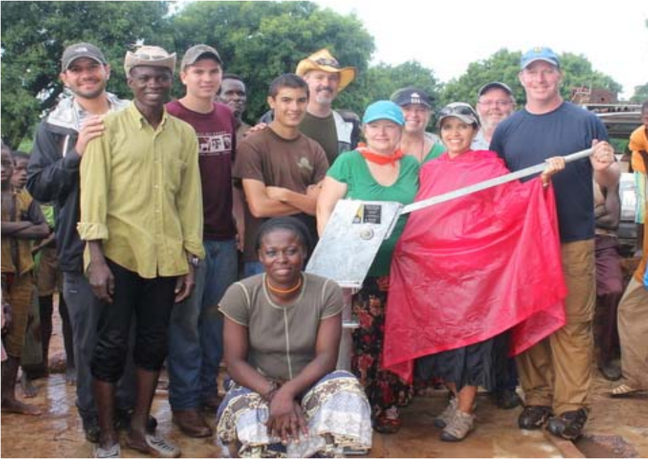
LWI Burkina Faso team and community members gathered for a picture before the team left the community.