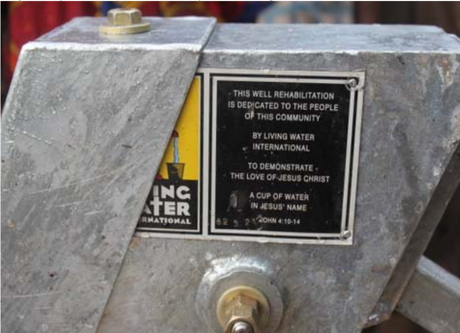
Close up of plaque on completed water project.