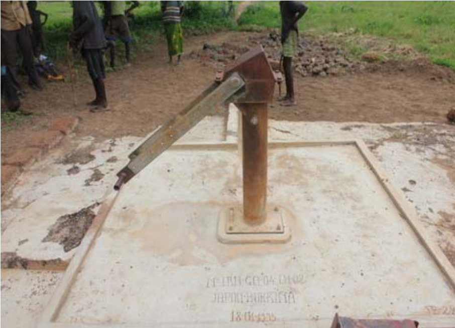
Previous water source left idle, forcing community families to seek alternate and contaminated water sources to meet their water needs.