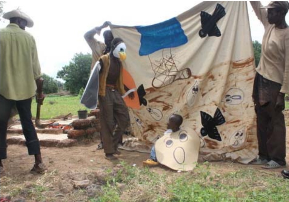
Community members participating in acting out oral Bible stories.