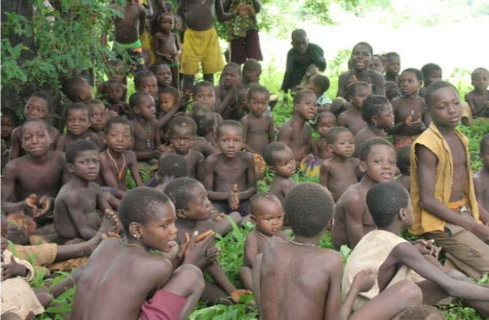
The community was very excited to hear the Gospel and learn stories about Jesus Christ. The community chief asked the team to return and help plant a church.